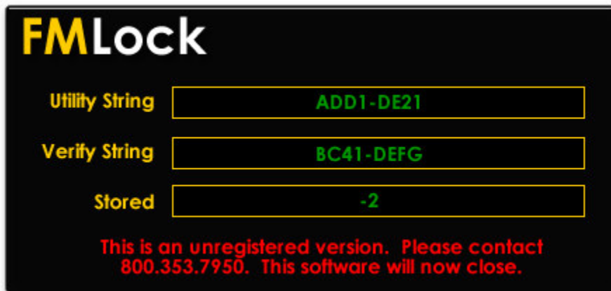
Figure 3. Hard Drive serial numbers do not match

Step 3. If the serial numbers do not match up, you can display a message, or just have the solution close. Pretty simple!